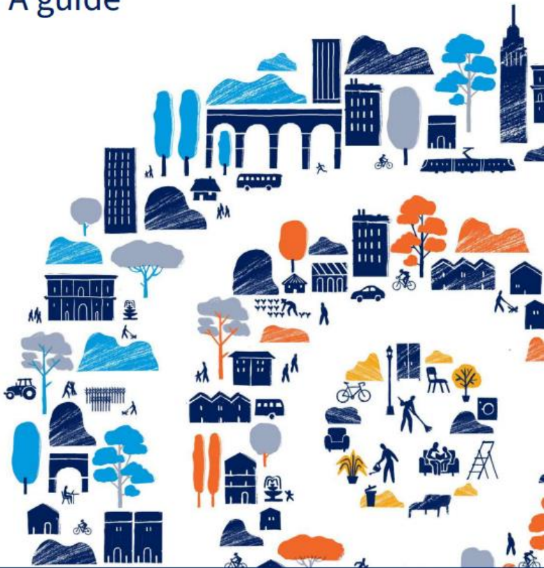
Fig. 11. Visual representation of the Age Friendly Ireland web of relations

National programmes for age-friendly cities and communities A guide